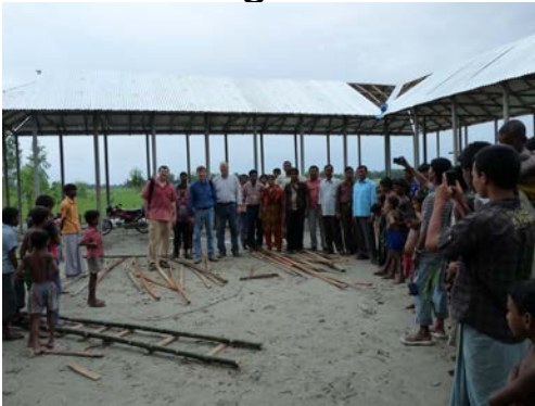
(School under construction that PFC helped to build)