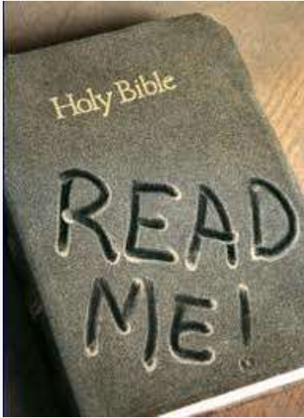
Psalm 33:20-22 (NIV1984)

20 We wait in hope for the LORD; he is our help and our shield. 21 In him our hearts rejoice, for we trust in his holy name. 22 May your unfailing love rest upon us, O LORD, even as we put our hope in you.